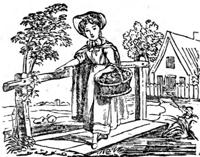
The Water=Cress Girl.

care to make the bed, sweep up the hearth, and draw her grandmother's elbow chair into the warmth of the sun, that she might sit there in ease, till her return from the houses where she was in the habit of calling with her basket of water-cresses; and as Susan was known to be such a good girl, she did not want for friends, who were always glad to buy of her. A lady, of the name of Meadows, had lately come to re-